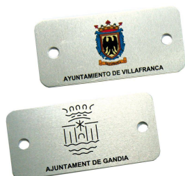
Aluminum plate 74 x 35 mm.