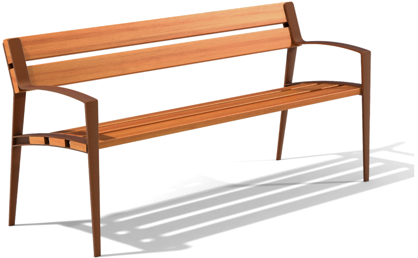
Mielek M PA691M