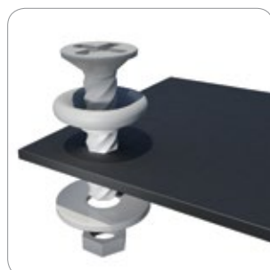
Fig. 1: 051SCP0200 Screw Connection Point