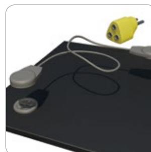
Fig 2: 051SFH0200 Female Socket