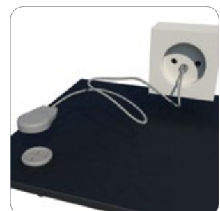
Fig 3: 051SFG0100 Ring Terminal