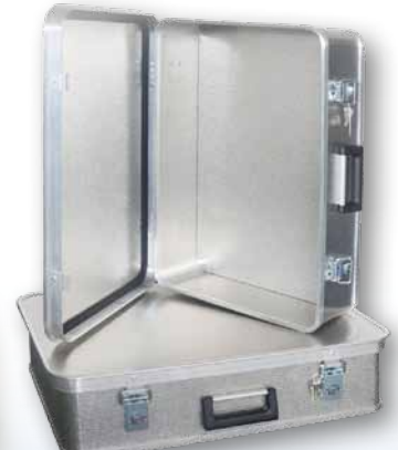
Model A 1539 / 36