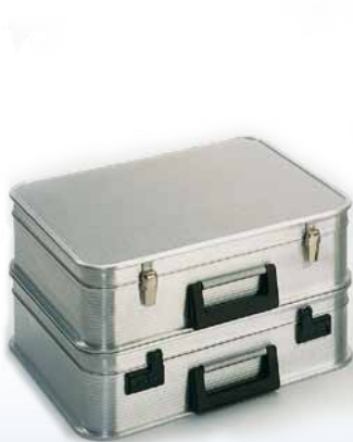
Model A 1439 / 19