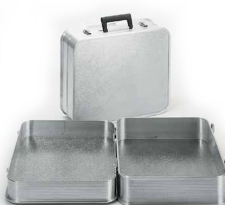
Model A 1489 / 24