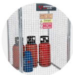
Gorilla Gas Cage GGC6