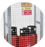
Gorilla Gas Cage GGC3