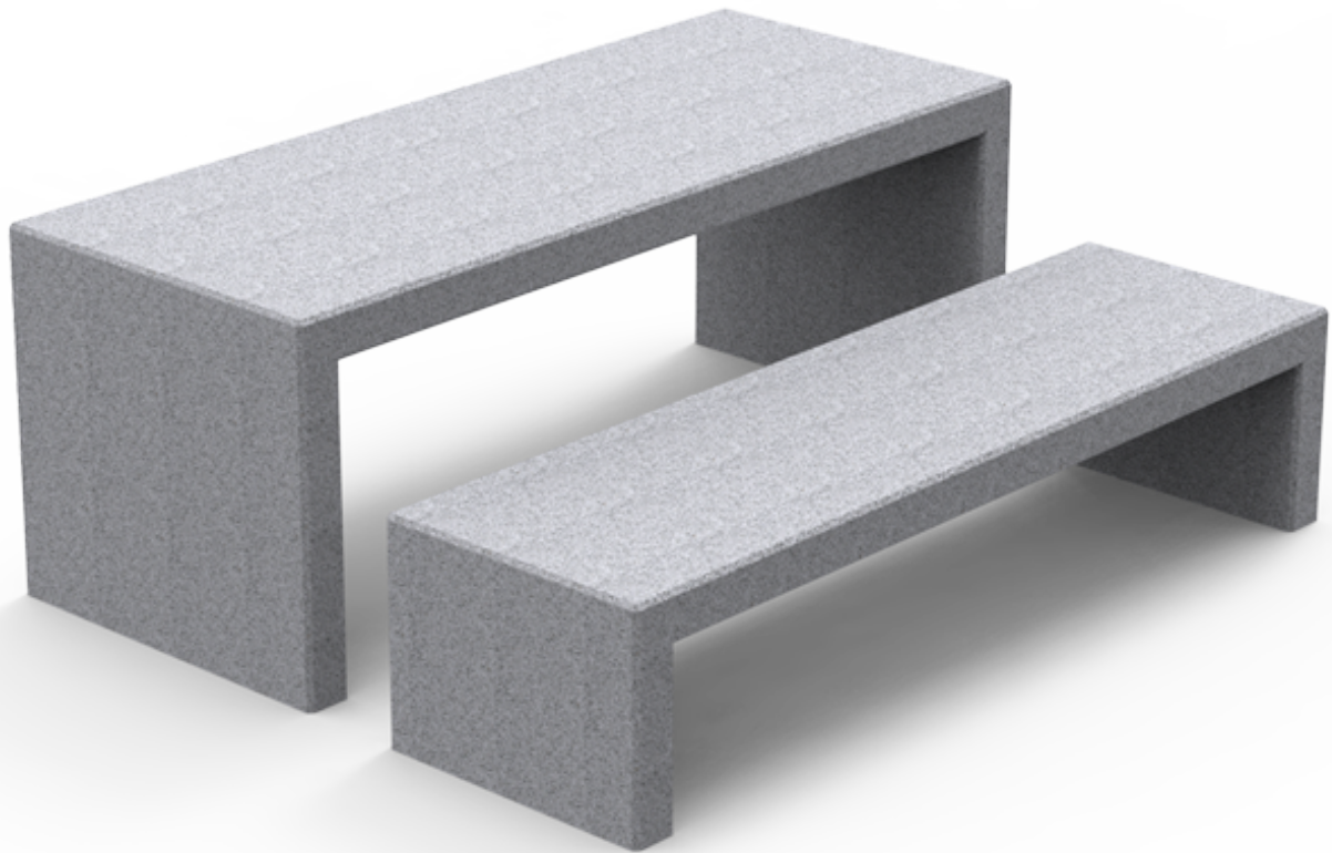
Table made of precast textured granite grey concrete. Recommended anchoring: free-standing.