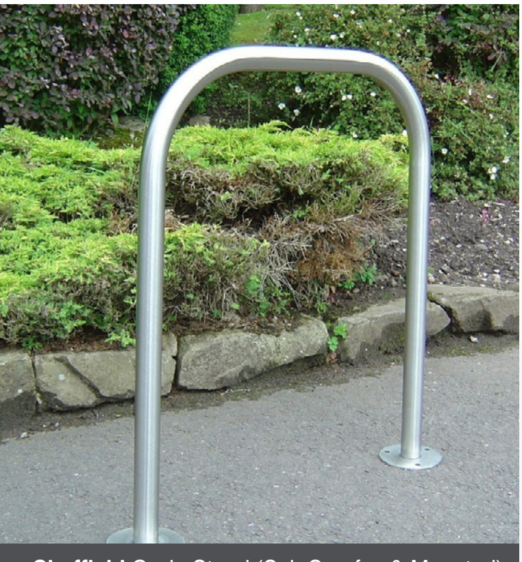
Sheffield Cycle Stand (Sub Surafce & Mounted)