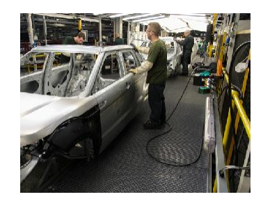
Flexible, one-piece Loose lay, no fixing Supplied in 10m required (33') rolls