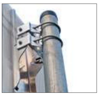
DURABEL IceFree Stainless Steel Mirrors

The unique DURABEL IceFree Stainless Steel mirror was developed to combat extreme weather conditions such as condensation and ice which affect the optical qualities of standard mirrors. The standard DURABEL Stainless Steel mirror is backed by a Thermo-active gel which regulates the temperature of the mirror surface, thus preventing the formation of condensation and ice.