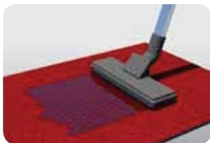
Injection/extraction cleaning periodically