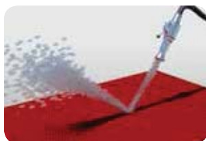
Water jet with soap periodically