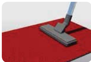
Vacuum clean top surface daily