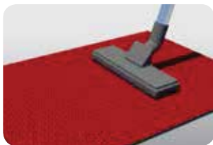
Vacuum clean top surface daily