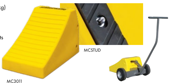
CT 1911 - 2 Wheel Transport Cart