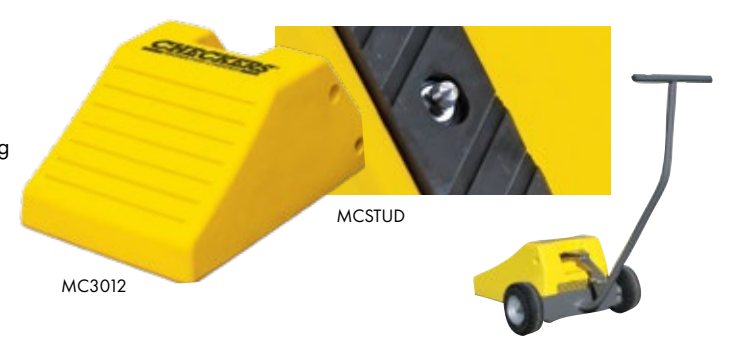
CT 1912 - 2 Wheel Transport Cart