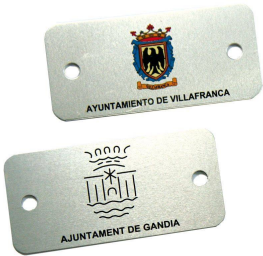
Aluminium plate 74 x 35 mm.

Recommended anchoring: by means of M10 expansion bolts depending on the surface and the project.