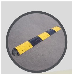
Pittman 50mm Speed Bump Kit

Ireland: B2 Athy Business Campus Athy, Co. Kildare R14 PK74 Ph: 01 531 2777 Email: sales@pittman.ie