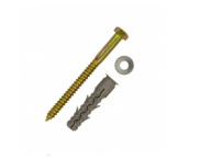
Safety Rider® Lag Bolts