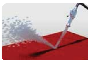
Water jet with soap periodically